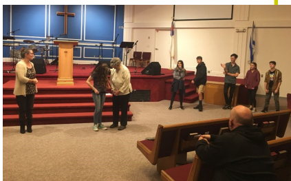
Our youth (in church and school) recently ministered to the body through a skit about people needing the Lord!