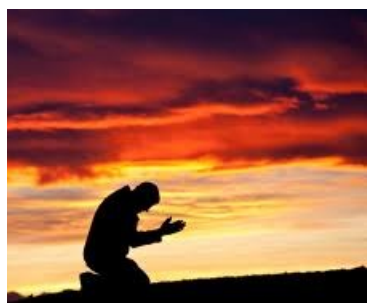
Prayer, both private as well as corporate, is the life blood of the church. Consider joining a small prayer group and commit to meet together at joint prayer meetings with other believers!