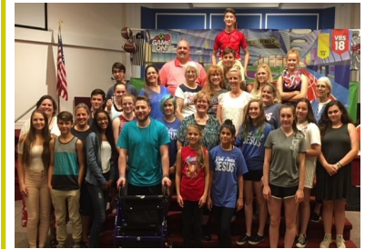
Last year's staff of VBS!

Invite you neighbors and those with children in grades K-6!